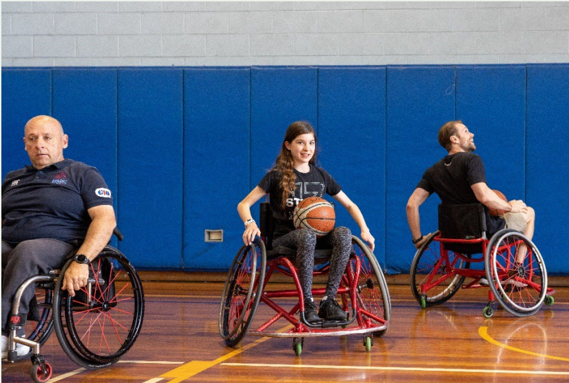
Photo: Wheelchair basketball at Ultimo Community Open Day 2022.