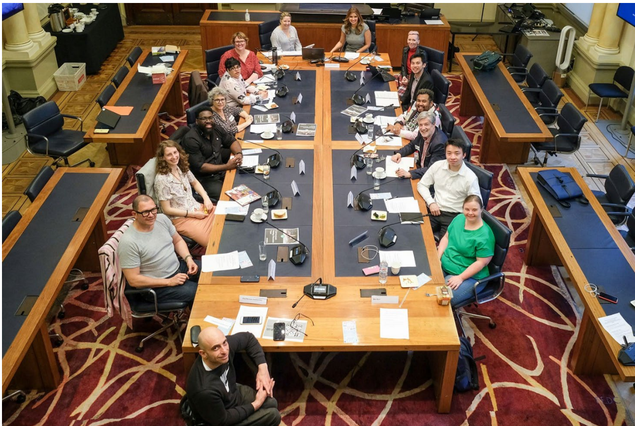
Photo: Group photo of the Inclusion (disability) advisory panel sitting at desks in Council Chambers.