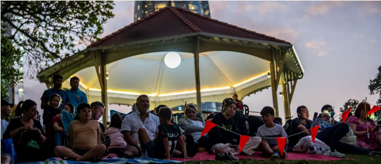
Photo: Families sit on Observatory Hill on Sydney New Year's Eve 2022.