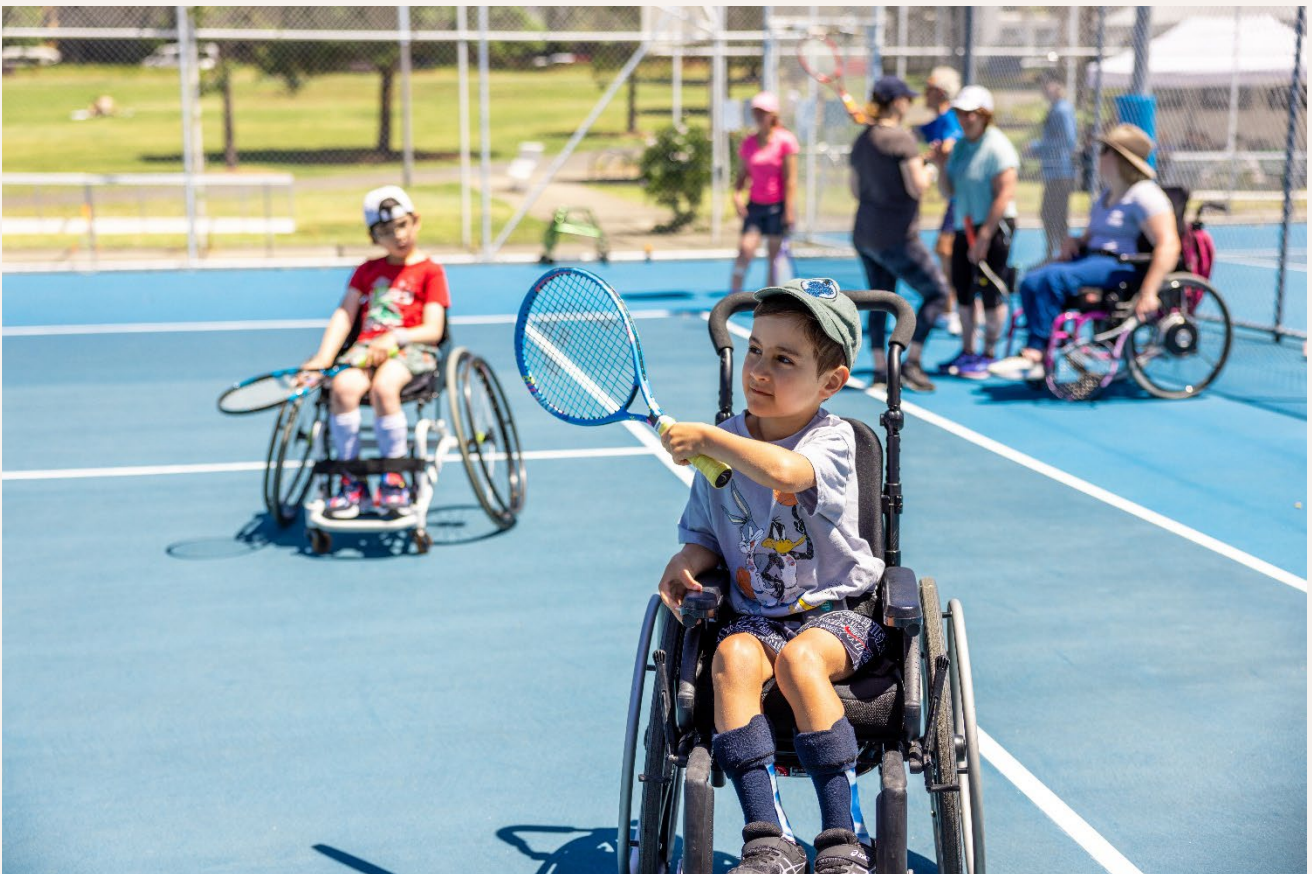
Photo: Young boy playing adaptive tennis using a wheelchair at Prince Alfred Park, Surry Hills.